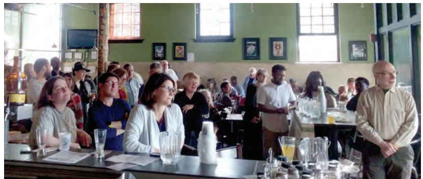
Thanks to all of the donors who attended the scholarship fundraiser and contributed more than $10,000 to be awarded to neighborhood scholars.