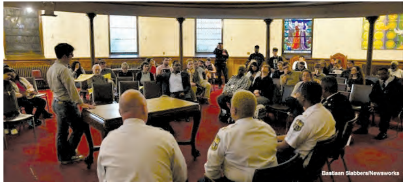
Town Hall Meeting

transferred the officers to the 3rd Police District in South Philadelphia, and the 8th Police District in Northeast Philadelphia. The PPD believes that any further changes to the officers' work assignments could be interpreted as additional punishment and may trigger additional union grievances.