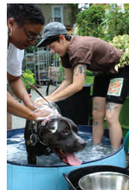
Dog Wash benefits PAWS

Besides monthly member meetings, BABA also hosts quarterly Happy Hour Meet & Greets, which are open to all, at local taverns, encouraging residents and business owners to mingle and become acquainted socially. The next BABA Happy Hour will be held on Wednesday, September 13th from 5 to 7 p.m. at Dock Street Brewery. For more information about BABA or BABA events check out babawestphilly.org, @babawestphilly, or #babawestphilly.