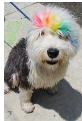
Dogs like hair color, too!