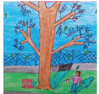
Art Installation Drawings

Day poem. Everyone enjoyed what turned out to be a beautiful spring morning in the park as well as delicious refreshments, compliments of donors, the Avenue Deli, Flounders Reality Group and Whole Foods Market. We are especially grateful to Bartlett Tree Experts for their major sponsorship of the Tree Care Project that funded the art display and equipment and supplies for the Junior Tree Keepers.