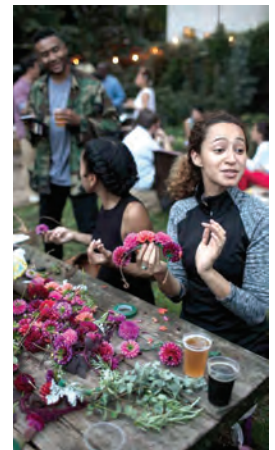
Neighbors made flower crowns at the Fall Fest.