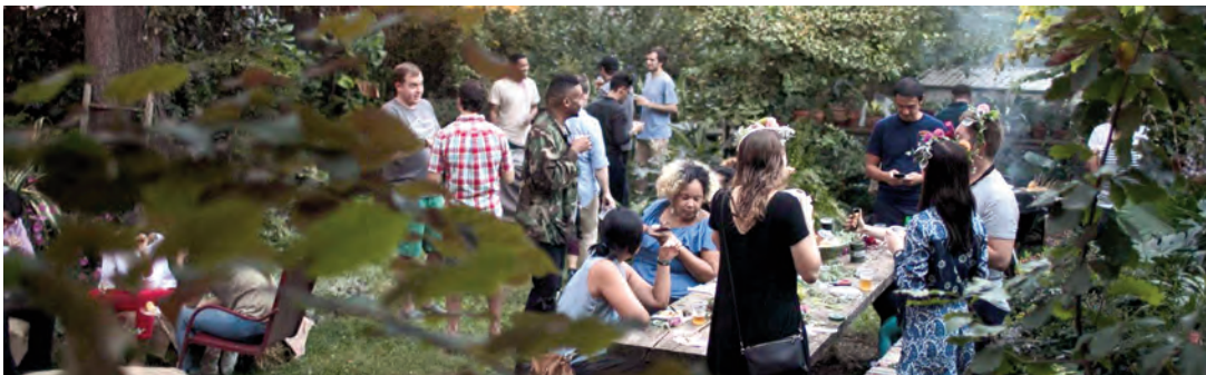
Fall Fest in Southwest dinner fundraiser benefitted Cedar Park Neighbors and Kingsessing Roadrunners.