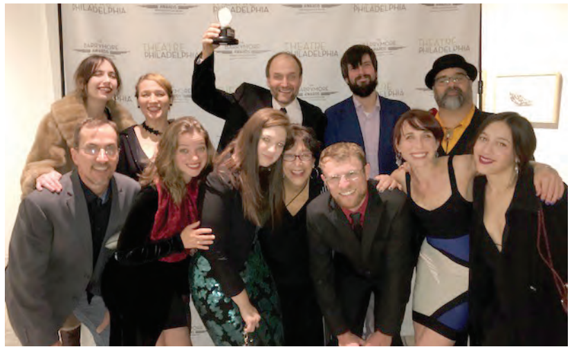
Curio company members attended the Barrymore awards ceremony, where they accepted the Victory Foundation Award for Outstanding Theater.

Named in honor of the Philadelphia-based first family of theatre, the Barrymore Awards for Excellence in Theatre have served as Philadelphia's professional theatre awards program since 1994. The Barrymore Awards are a nationally recognized symbol of excellence for professional theatre in