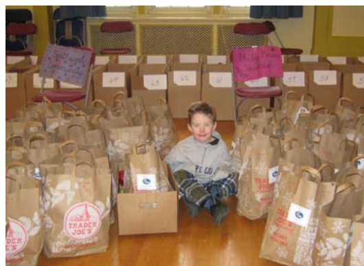
Volunteers help to pack 148 Holiday Baskets for Families in Need.