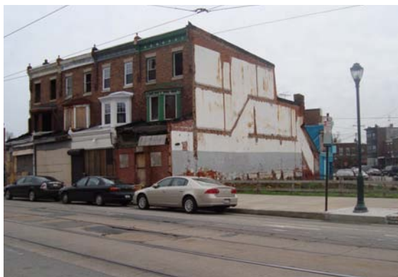
What would YOU Like Baltimore Avenue from 49th to 52nd Streets to look like? Speak up!

We need to hear from you! Your opinion matters.